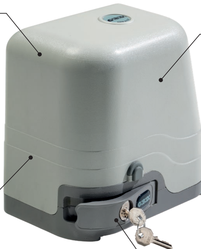
MANUAL RELEASE DEVICE WITH PERSONALISED KEY