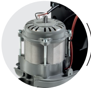
POWERFUL ELECTRIC MOTOR