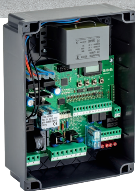
FOTO AUTOMATIC GATES