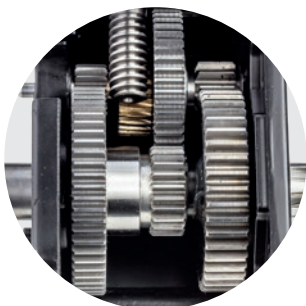
STEEL AND BRONZE GEARS

OPEN/CLOSE LIMIT SWITCHES WITH DOUBLE READING