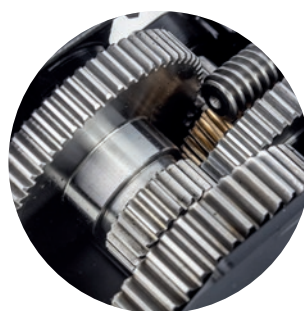
STEEL AND BRONZE GEARS